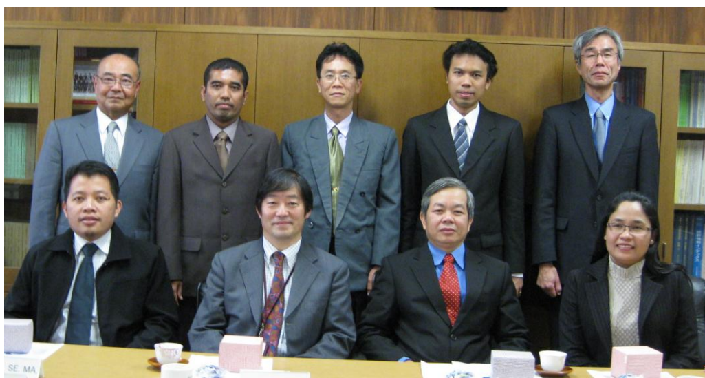
Courtesy call on the Director-General of the Statistics Bureau of Japan on 11 Dec. 2013

Based on the Charter of an Experimental Laboratory for Research Purpose Statistical Use of Micro Data (LMD which has been signed or endorsed by 9 member countries), we continue to resample at a rate of 80% the original data sets to construct the Laboratory data base.