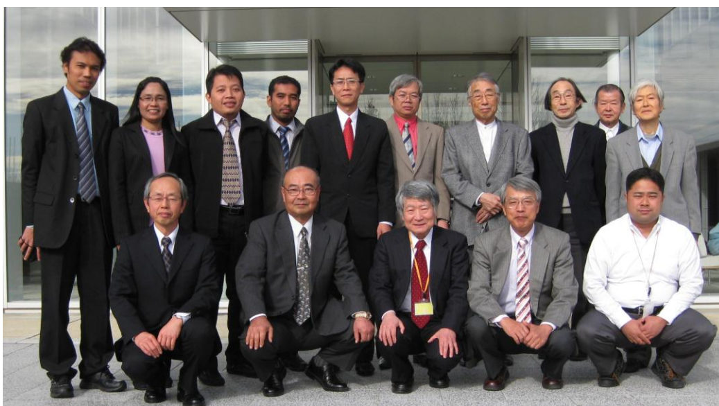
Group photo at the back entrance of ISM on 17 Dec. 2013

We plan to continue to hold such a workshop once a year; invite statisticians from member NSOs by rotation; ask them to clarify about the micro data sets they have provided to LMD; and examine the usefulness of the above mentioned resampled data sets.