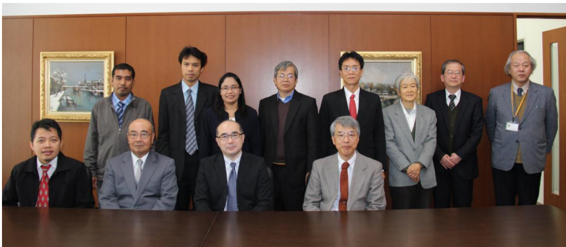
Courtesy call on the Director-General of the ISM on 12 Dec. 2013